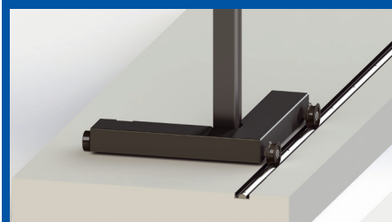
Traversable axle load: 18 t without levelling capability