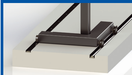
Traversable axle load: 18 t with levelling capability

BR380001_007-en 01 · Subject to change without notice! The illustrations also show options which are not standard equipment.