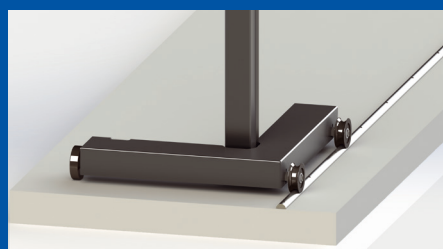
Traversable axle load: 18 t without levelling capability