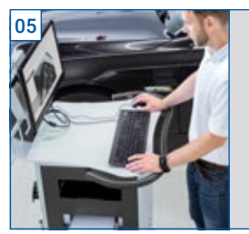
A generously sized work surface and multifunctional storage space for a PC, printer, probes and cables.