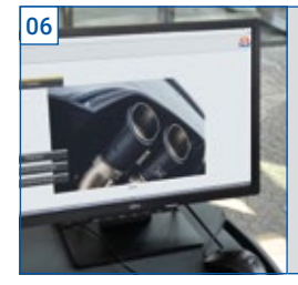
The user-friendly software helps you save both time and money during repairs and offers a high level of educational and training-related expertise.