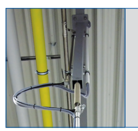
The E-BOX is attached to the ceiling or mounted to an on-site profile using a special fastening set.