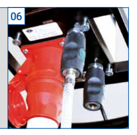
Easy handling of compressed air couplings, which are arranged at the bottom (safety compressed air couplings ISO 4414, EN 983), and the (400 V) power supply.