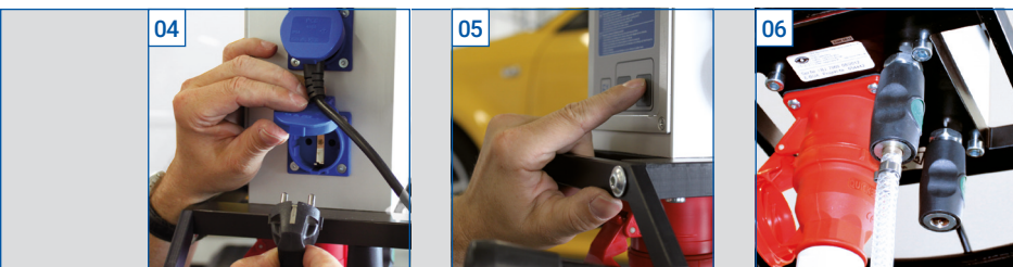
04 Ideal distance of sockets for easy access.