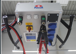
Lift control, power supply, compressed air and data socket positioned on bottom side.