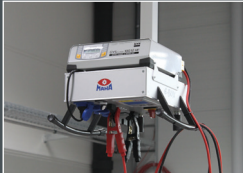
With GYS-Flash charging computer