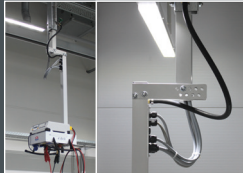
Special suspension with integrated power cord ensures vertical installation of E-BOX.

Equipped with 5 m cable with CE declaration as standard