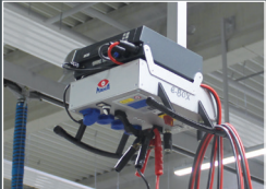
With Eltek charging computer