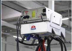
With Deutronic charging computer