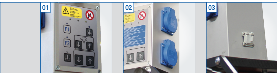
01 Integrated lift control (option)