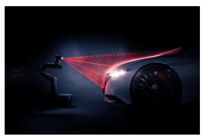
The MAHA Autonomous Inspection Assistant (MAIA) carries out checks on a car

Click on the following link to read the latest news about MAHA's trade fair highlights: MAHA | Automechanika 2024 trade fair highlights